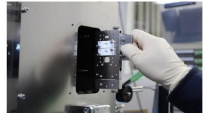
Sample holder for transmission measurement